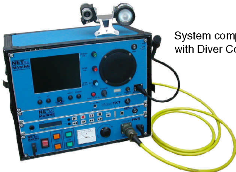
System complete with Diver Comms