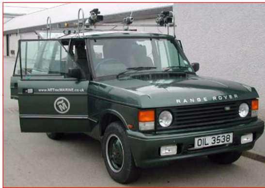
Video survey vehicle with roof mounted cameras